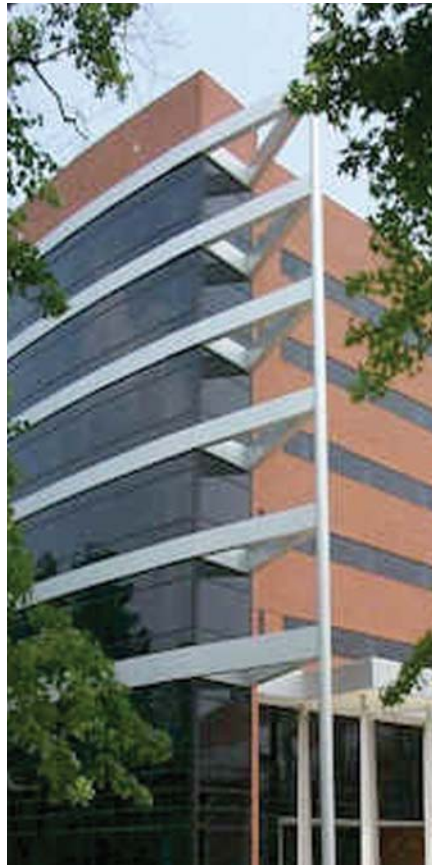
The Applied Research Center (ARC) at Old Dominion University

Together with its partners in industry, academia, and state and federal laboratories, Old Dominion University is setting a new standard in research and development and deployment of entirely new classes of applications and products using lasers and plasmas in the manufacturing process.