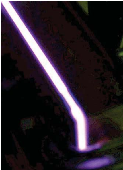
Atmospheric plasma source for large area materials processing