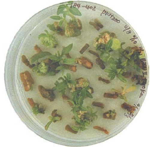
Regenerating transgenic poplars in a Petri dish.