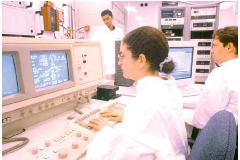
Students perform scanning electron microscopy (SEM) on a photodetector chip in a Nanolab. The SEM at NCSU is uniquely configured to provide both optical and structural information about the chips in order to develop entirely new classes of photonic devices.

The explosive growth of the internet and the dramatic globalization that impacts every facet of life is fueled by the rapid acceleration of advanced computing and communication systems. At the Center for Advanced Computing and Communication (CACC), multi-disciplinary teams collaborate with researchers from industry, government agencies, and other universities to develop and implement these leading-edge systems. CACC initiatives include complex, fault-tolerant, and distributed computing systems as well as underlying technologies such as photonics, pervasive computing, and wired and wireless elements.