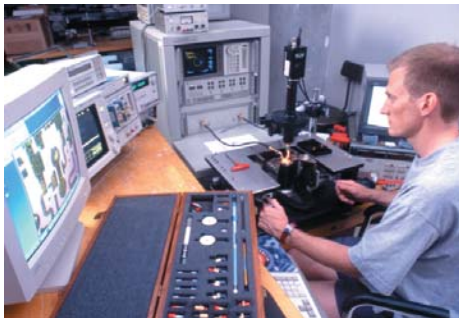
Graduate student making microwave frequency measurements using a network analyzer and probe station in the Microwave Lab.